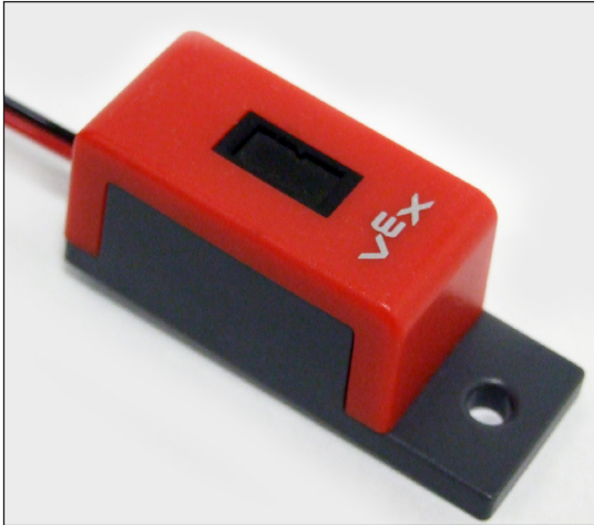
The Line Tracking Sensor for VEX

The VEX Line Tracking Sensor allows the robot to tell objects or surfaces apart based on how dark or light they are. It shines a beam of infrared light out onto the object, and measures how much light is reflected back.